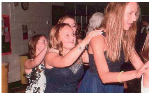
2017 Zenith Above 2003 Zenith Below