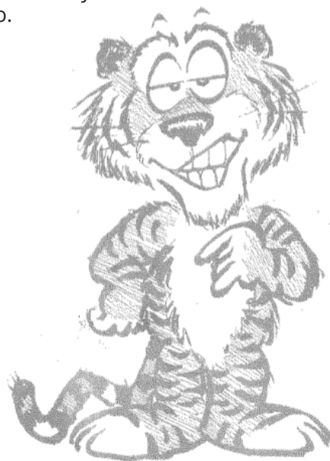
From the cover of the CFHS Student Handbook, 1976-77 Drawn by Bill Watterson '76