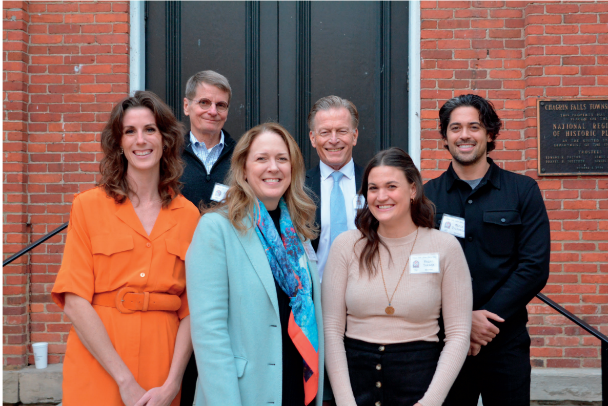
Halls of Fame Induction Class of 2022