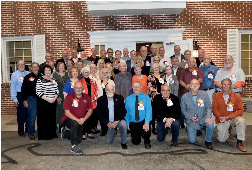
Class of 1970 Reunion