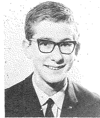
Al's new brother

Mike is one of a group of 20 English students who have come abroad late on a special program. Because they are applying to certain top colleges in England, these students were required to stay in their country until the middle of the school year.