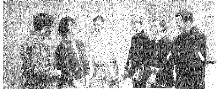
Decisions, decisions ...

Happiness and joy and a vacation from school. All the brothers and sisters home from college. Fat men in red suits and Salvation Army bells. A time when giving is such a wonderful thing. A time for Charlie Brown and Snoopy to come alive. The birthday of someone that people don't remember. Fancy cooking and calories. A time to always remember, never forget. A wonderful end to a wonderful year.