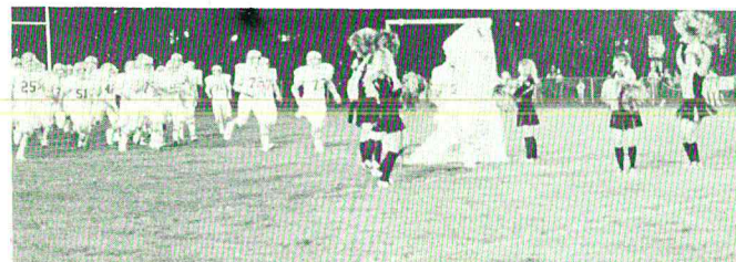
The Chagrin Falls Tigers take to the field for their first league game against Twinsburg.