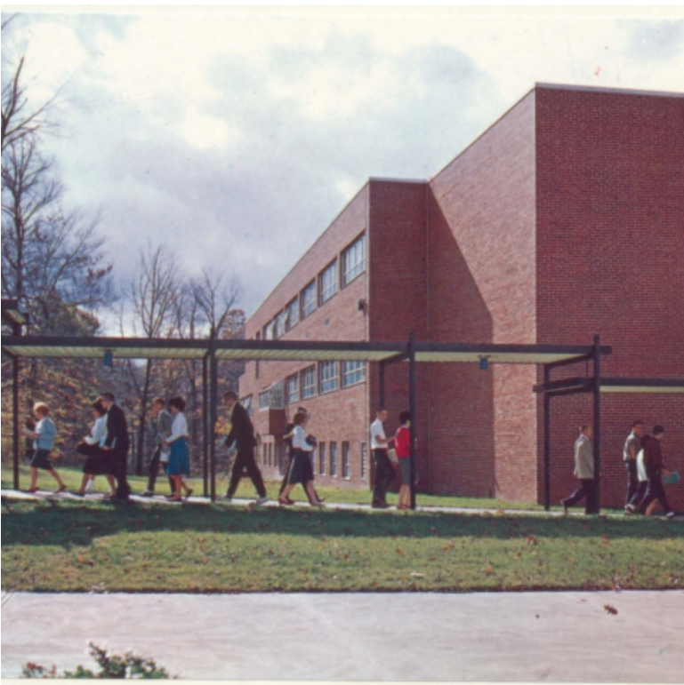
Right: Students passing from building to building in 1963