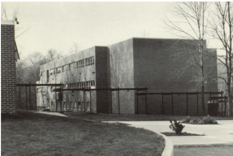
Left: A photo from the 1965 Zenith showing the main high school building with the language arts wing, which would later be Commons, on the left.