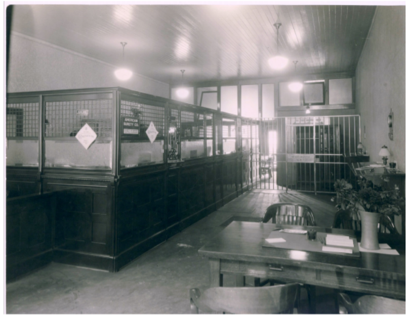
Interior of the First National Bank of Chagrin Falls - 1920