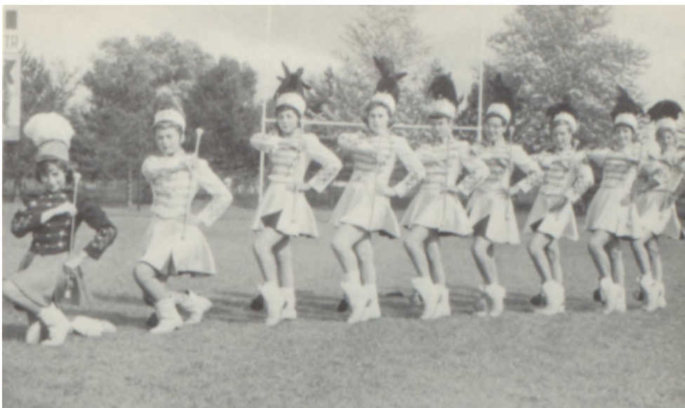
Majorettes from the 1956-57 school year.