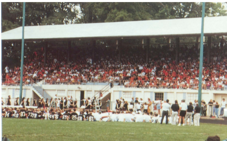
Left: All school spirit assembly 1996-97.