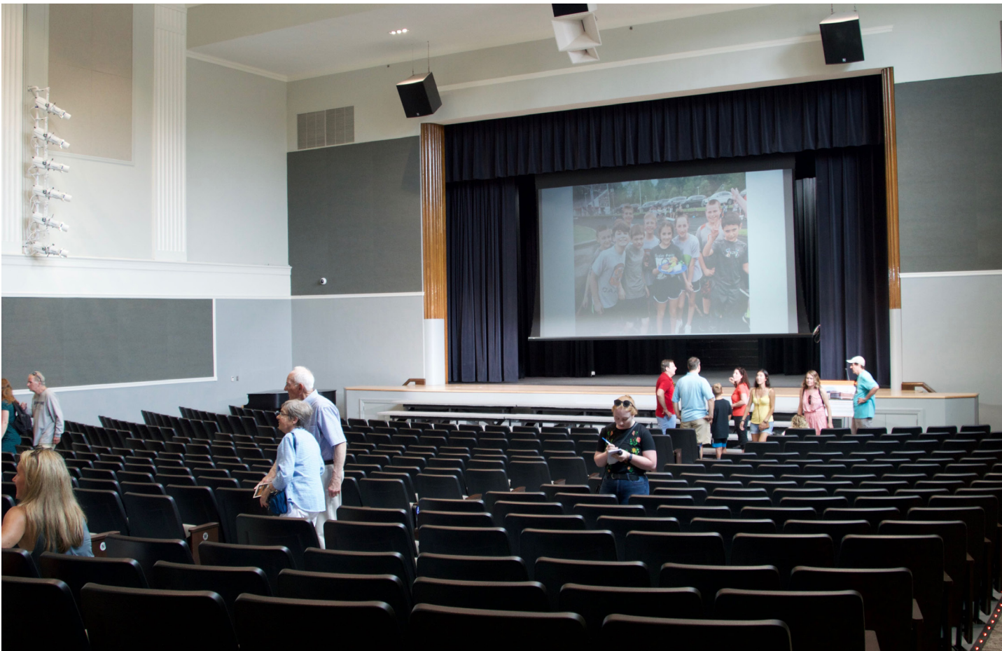
To the left: The auditorium has the same structure as we all remember, but the updates made to it were tremendous. It has a warmth to it and brighter look.