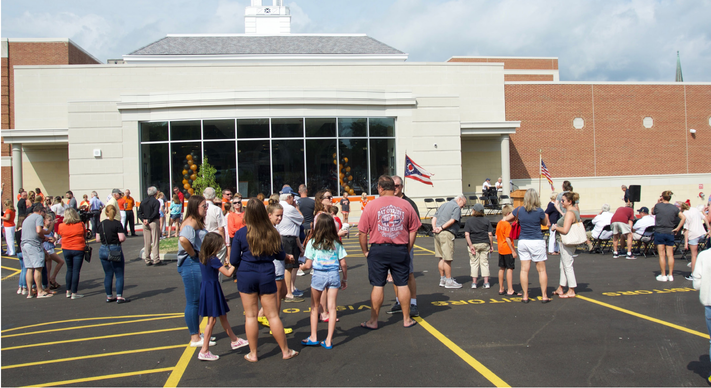
To the left: An impressive entrance for our students.