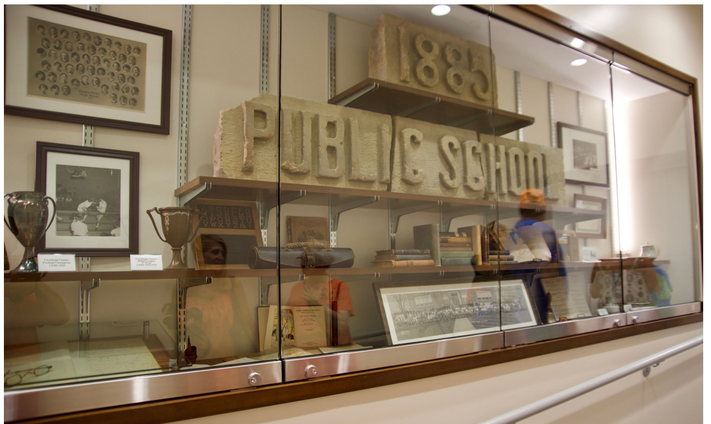
To the right: The School made sure to highlight three walls with throwback pictures of the campus over the past 150 years. Besides the CFAA and the Chagrin Falls Historical Society having touch screens in the auditorium lobby, the two groups have filled this display case with historical items dating back to the Public Stone from the 1885 building.