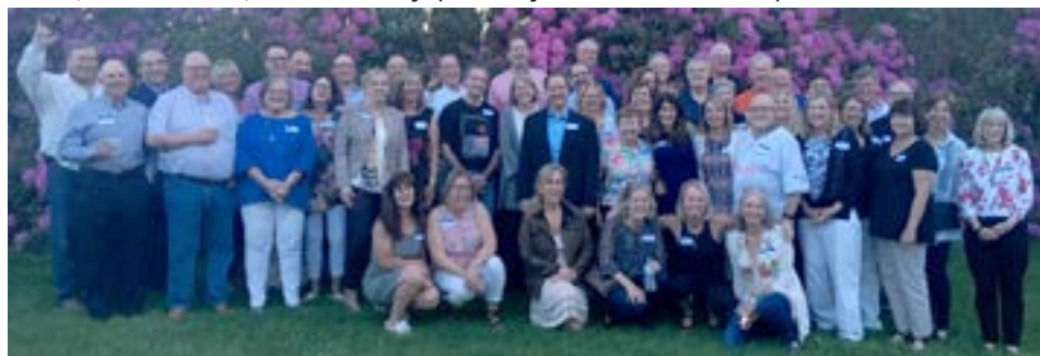
Class of 1977 Reunion