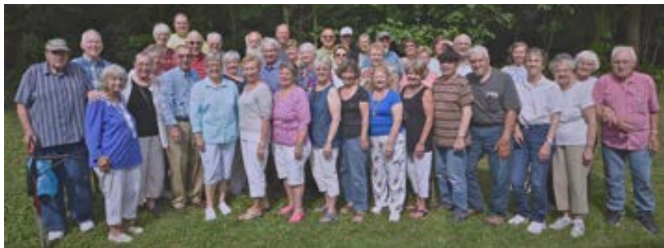
Once again the retirees got together for their annual summer picnic at The West Woods in Novelty.